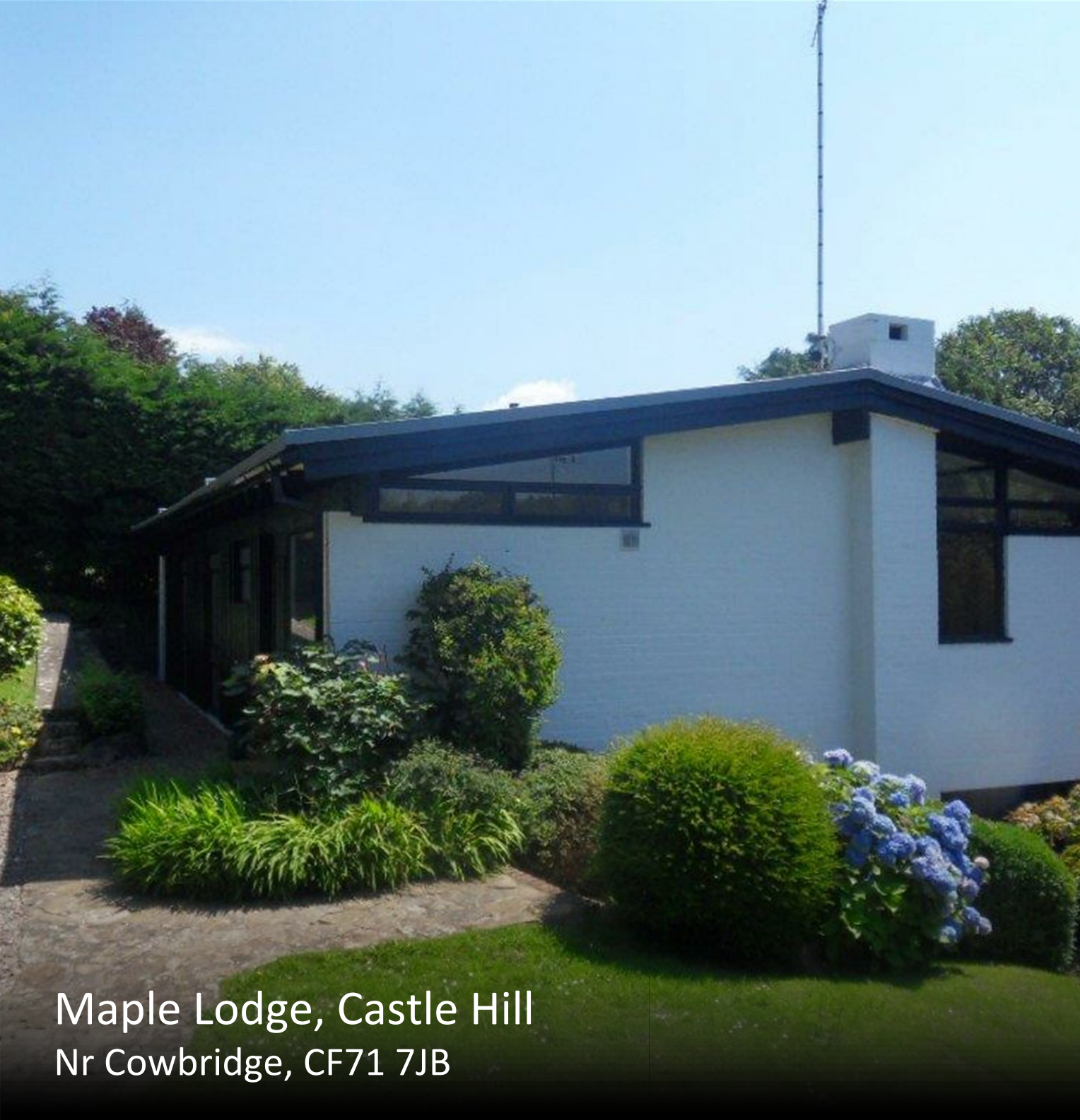
Maple Lodge, Castle Hill Nr Cowbridge, CF71 7JB